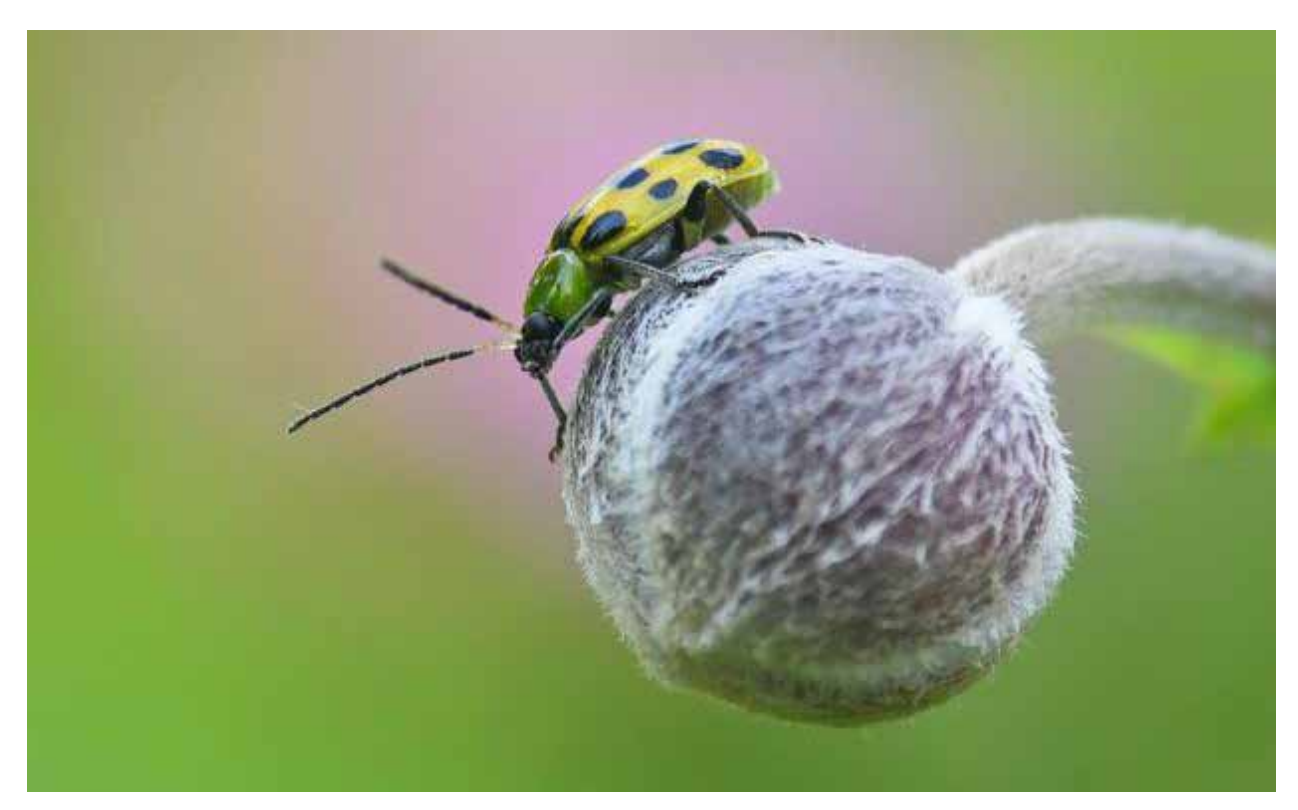
A cucumber beetle, one of the many agricultural pests that bats feed on.

Traditional analysis of insectivorous bats' food habits (through the microscopic identification of insect parts in bat feces) have shown that bats consume many prominent agricultural pest species (reviewed in Kunz et al. 2011). It is therefore reasonable to assume that consumption of these insect pests may represent a source of pesticide exposure – especially where there is a delay between treatment and insect mortality, where the insects were sub-lethally exposed or when insects are externally contaminated on their wings, hairs or scales by dust or droplets. The broad contamination of terrestrial and aquatic systems by neonicotinoid insecticides ensures that a broad brush of insect species beyond the pest species will be contaminated (see section 4.4. below). Kunz et al. (2011) cited some key pest species and crops where bat predation might occur: June Beetles (grasses, cereals, sugar beet, soybeans and potatoes), Wireworms (most crops), Leafhoppers and Plant Hoppers (rice, potatoes, grapes, almond, citrus and row crops), Corn Rootworms/Spotted Cucumber Beetles (corn, spinach, cucurbits), Stinkbugs (fruit trees, corn, cereals and vegetables), Cutworms (most crops), Tortrix moths (fruit and nut trees), and Snout Moths (nut and fruit trees, cranberries).