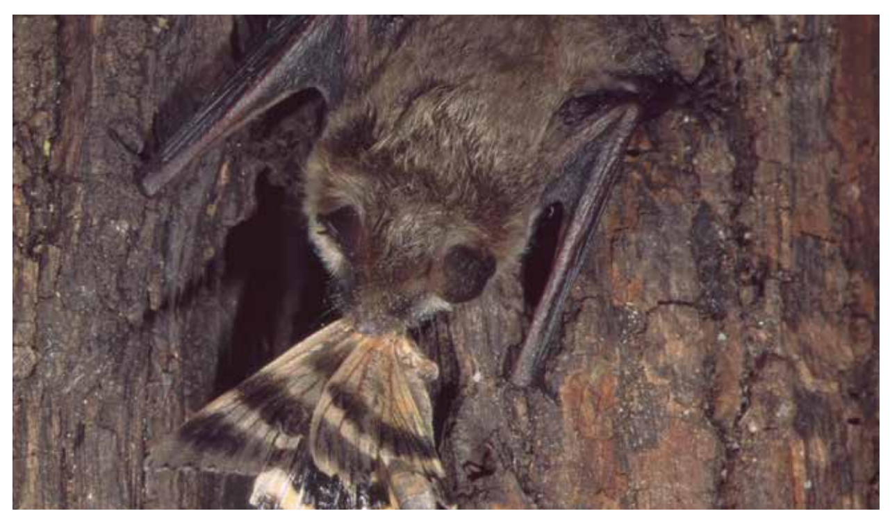
Bats are exposed to pesticides by consuming pesticide residues on their prey.

The presence of residues at that time of the year suggests a much longer persistence than expected, possibly as a result of the bats going into torpor. This raises a question about how well the murine or dog toxicology database (reviewed below) can represent a heterothermic bat species (alternating seasonally between torpor and euthermy) given that the metabolism of ingested residues may differ substantially between those two periods.