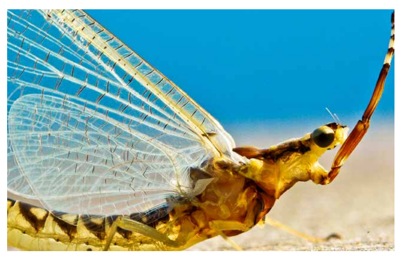
A Mayfly, of the order Ephemeroptera. One of the many aquatic insect species in the bat diet and sensitive to neonicotinoid pesticides.

Studies by Wickramasinghe et al. (2003, 2004) and Kniowski et al. (2014) emphasize the importance of water bodies for foraging. The findings of reduced insect availability and foraging opportunities associated with surface water on conventional farms compared to organic ones is a clear indication that disruption of aquatic food webs as a result of pesticide contamination is likely affecting bats.