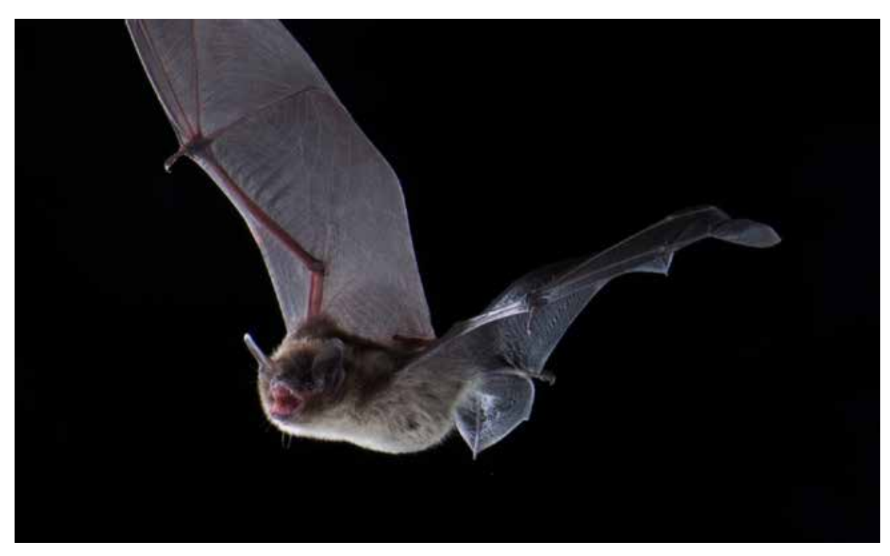
Bats are generalist predators. Little Brown Myotis foraging.

The two main foraging strategies of insectivorous bats are aerial hawking and gleaning from surfaces. Several species appear to show plasticity in that regard and can use either strategy even if one dominates (Ratcliffe and Dawson 2003). In the context of pesticide exposure, we propose that gleaning from plant surfaces would result in greater exposure potential (see section 4.4).