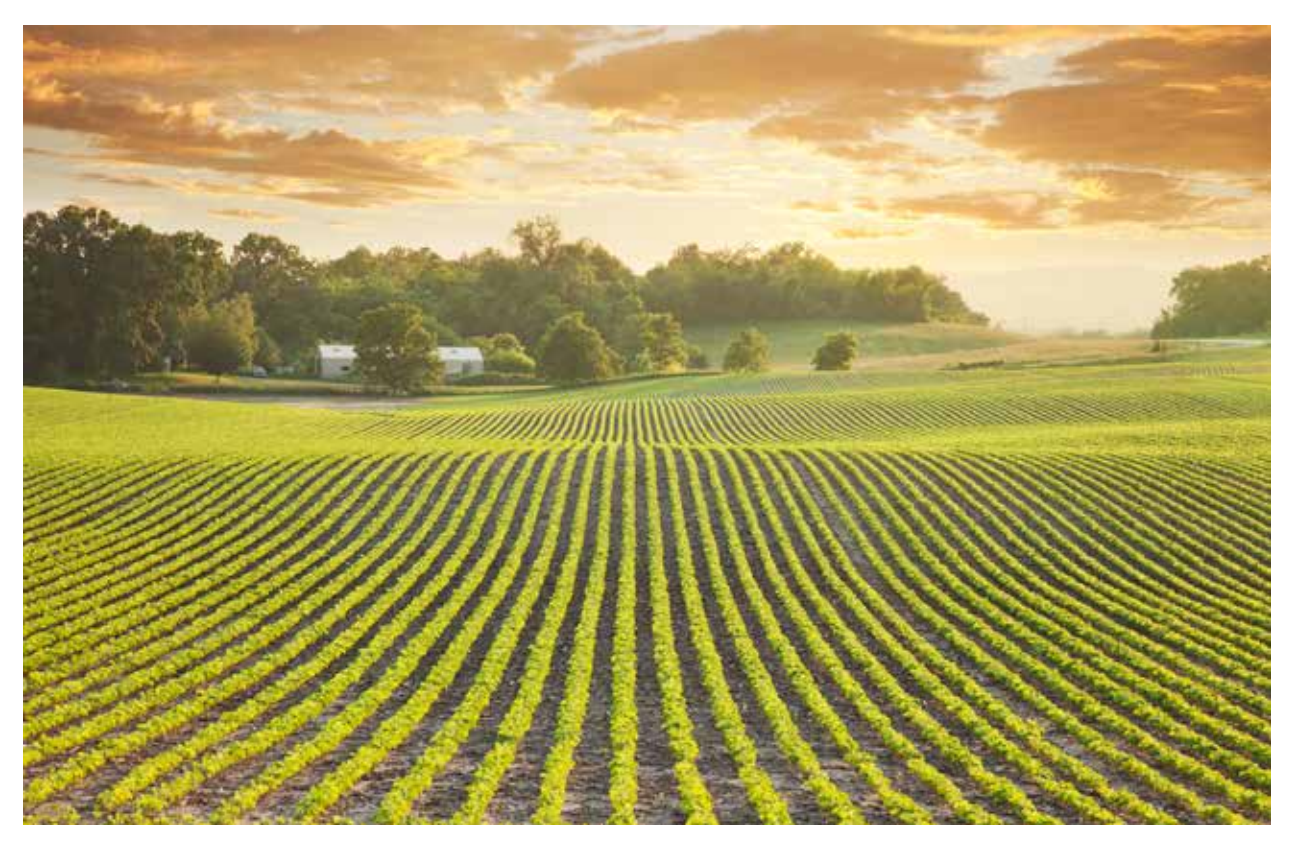
Agricultural intensification is associated with increased use of pesticides and decreased insect abundance.

One interesting feature of the German Krefeld Society data on which the Hallmann et al. (2017) analysis was based is that hoverflies, as a group, showed a particularly steep decline (Vogel 2017). They are pollinators highly dependent on nectar and pollen and are therefore vulnerable to impacts of systemic products such as the neonicotinoids. Indeed, in her reporting and analysis of the Krefeld and other data, Vogel (2017) singles out neonicotinoids as likely culprits.