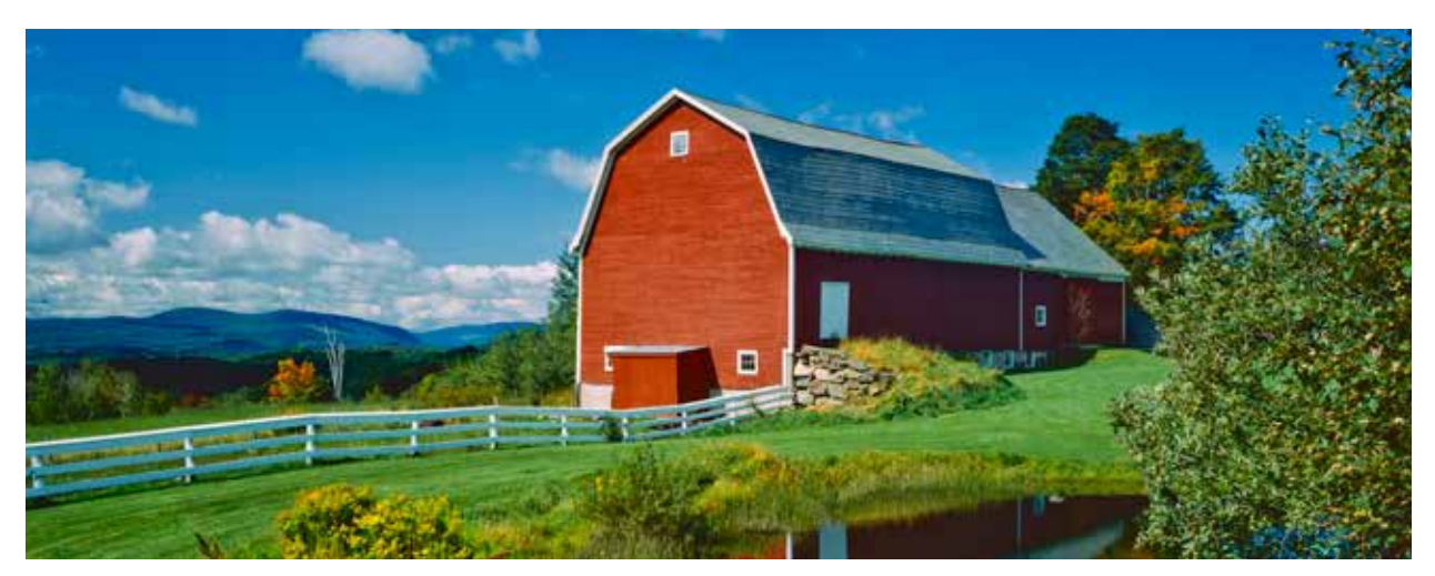
Natural habitat on farmland provide important foraging opportunities for bats.

Sirami et al. (2013) reviewed several studies where agricultural crops offered foraging opportunities for bats, notably vineyards, olive groves, cotton fields, cacao and banana plantations. However, they stressed the importance of natural features (woodlots, hedgerows or tree lines) as well as natural or impounded bodies of water as focal points for foraging activity even though foraging in their own study was as intensive in the crop areas surrounding artificial wetlands than over the wetlands themselves. Similarly, Stahlschmidt et al. (2017) documented the use of orchards, vineyards and field crops by foraging bats in Germany; although foraging intensity was highest along forest edges there was no difference between agricultural and non-agricultural sites. Their conclusion was not so much about the benefit of bats for pest control in cropland but a concern for potential exposure of bats to the suite of pesticides applied on those crops. We will be looking at this in detail in section 4.