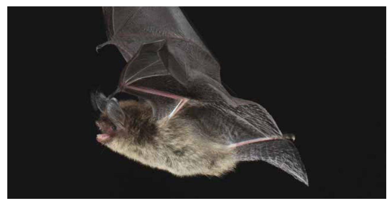
Caption: Northern long-eared Myotis foraging.

In the case of acetamiprid, it appears that the dose levels that have been shown to cause immune toxicity are in fact higher than those derived from more 'standard' endpoints in the corpus of mammalian toxicology studies.