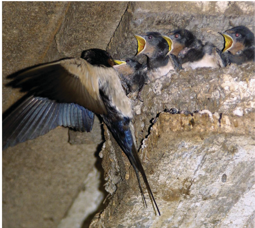
Feeding time: Many bird species depend on insect prey, particularly for feeding their offspring, which means that a broad decimation of insect species by pesticides can have knock-on effects on the bird populations. The image shows the barn swallow ( Hirundo rustica ), one of the six species whose decline across the Netherlands was found to follow a statistical correlation with the accumulation of the neonicotinoid imidacloprid in the environment.

In a paper summarising the overall conclusions from the WIA's analyses, Jeroen van der Sluijs and colleagues identify the key reasons why systemic pesticides, although initially hailed as a greener solution, have become such a large cause for concern. The problems arise, essentially, from the combination of their widespread, often prophylactic use, their very high toxicity to invertebrates, their