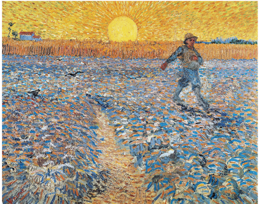
Sowing seeds: A century after Van Gogh, agriculture in his native country started to become highly reliant on seeds coated with systemic pesticides. Ecologists are now warning that their accumulation in the environment affects a wide range of species, including birds.

While correlation does not prove causation, the authors have carefully controlled for several possible causes, leaving the pesticide contamination as a likely factor contributing to the