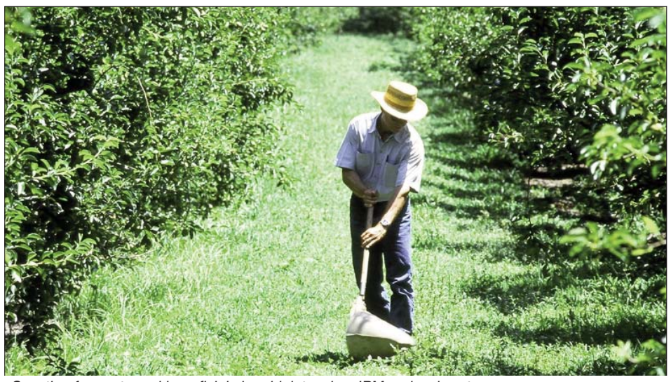
Scouting for pests and beneficials in a biointensive IPM orchard system

In bio-IPM, a variety of tactics are used to suppress pest populations. The goal is to keep populations of pests below damage thresholds, so that more intrusive, costly, and often risky interventions are not necessary. When