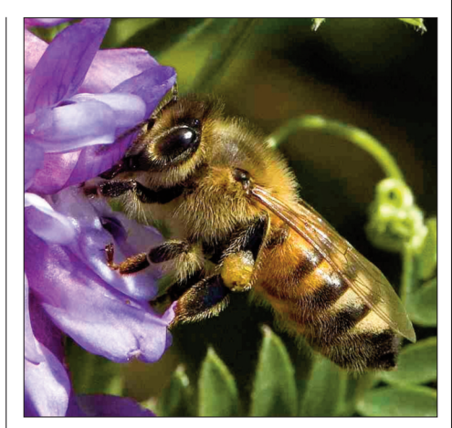
The decline of the honey bee may be a sign of wider ecological degradation

While each of these co-factors has been present for some time, beekeepers point to the relatively recent introduction of systemic neonicotinoid insecticides as a critical, potentiating co-factor. Systemic pesticides are applied at the root (often as seed coating or a soil soak), taken up through the plant's vascular system and are subsequently found in