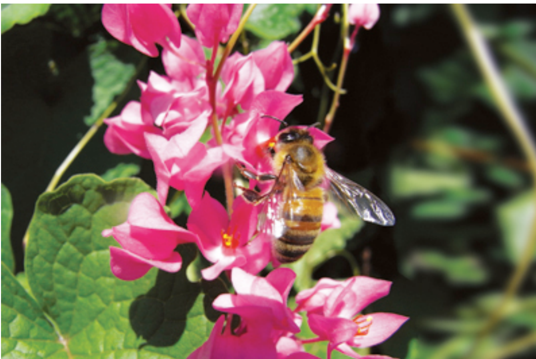
Honey bees can pick up neonicotinoids from flowers